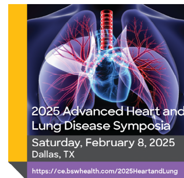
EXHIBIT REGISTRATION: 2025 Advanced Heart and Lung Disease Symposia